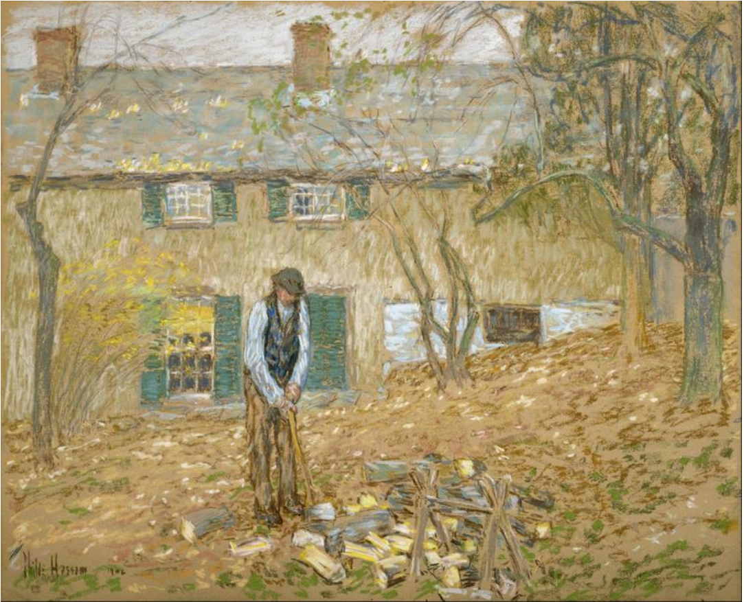
Woodchopper , 1902. Hassam, Childe, 1859-1935. Museum of Fine Arts, Houston, TX.