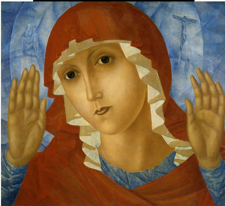
Mother of God of Tenderness Towards Evil Hearts , 1914; Petrov-Vodkin, Kuzma; Russian Museum, St. Petersburg, Russia.