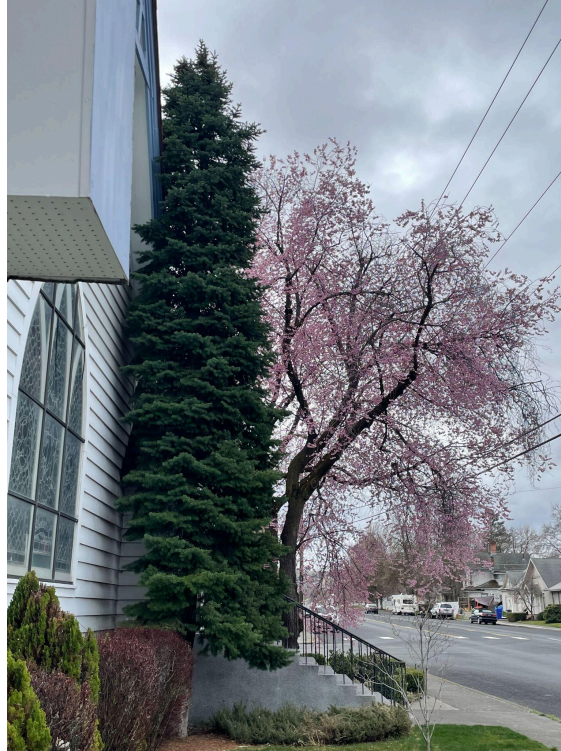
Tree in bloom at Nativity