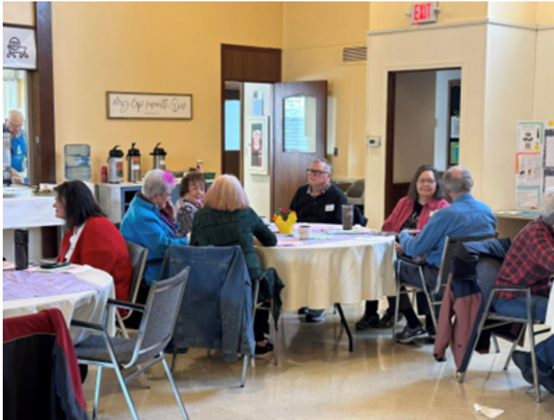
Gathering Day 2025